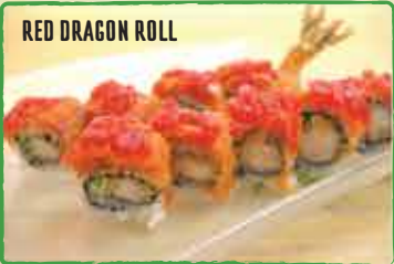
RED DRAGON ROLL