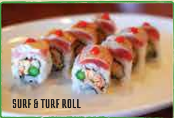
SURF & TURF ROLL