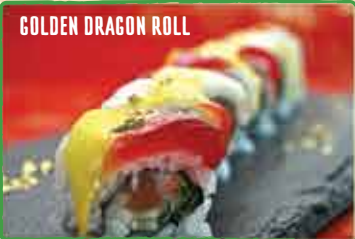
GOLDEN DRAGON ROLL