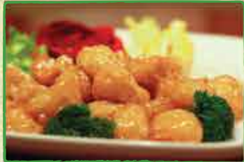
LEMON SESAME CHICKEN