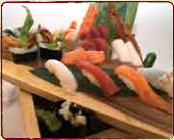
SUSHI SASHIMI COMBO